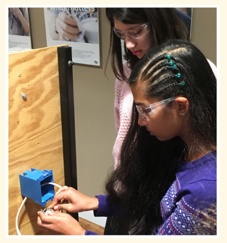
Tour Your Future, a Carnegie STEMS Girls careerexploration program, visited Eaton in January.