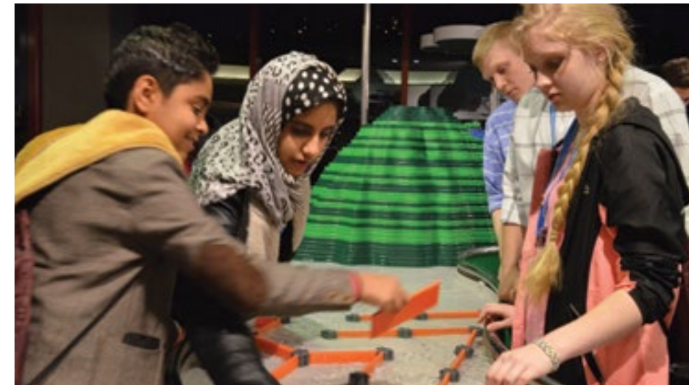
Carnegie Science Center invited the 1,700 Intel International Science & Engineering Fair students to enjoy an evening of scientific fun at the Science Center in May.