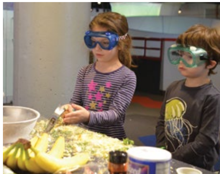
Children discover the science behind culinary chemistry during the Science Center's Science Communication Fellowship event.